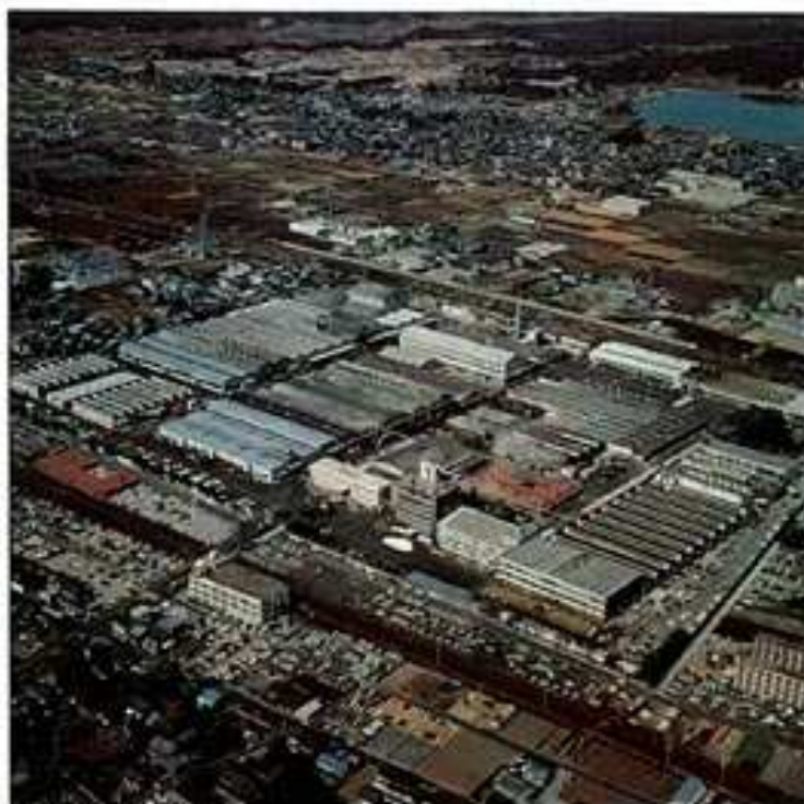
Head Office & Main Plant

Suzuki has pioneered two-wheel power and perfected it to the all-out performance package that you get in Suzuki motorcycles. This is one of the reasons a Suzuki motorcycle is also a maximum value purchase. Suzuki sets the standards in bike performance that others follow. But innovativeness at Suzuki is nothing new—we've always been forward-looking. As proof, we offer the RE-5 revolutionary rotary engine motorcycle. Total service worldwide is nothing new for Suzuki either. We're dedicated to assisting you after you've selected a Suzuki no matter where in the world you are. That's why Suzuki friendly assistance is always conveniently nearby.