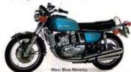
Maui Blue Metallic